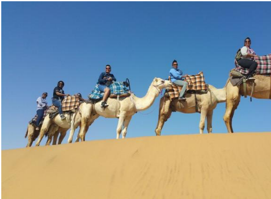
Desert on camels